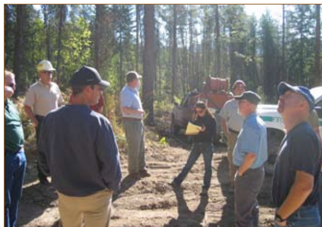
Coalition members in the field.

The Coalition has developed a blueprint for cooperative communication and, from that, a community plan.