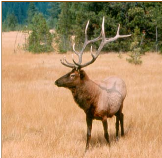
Elk.