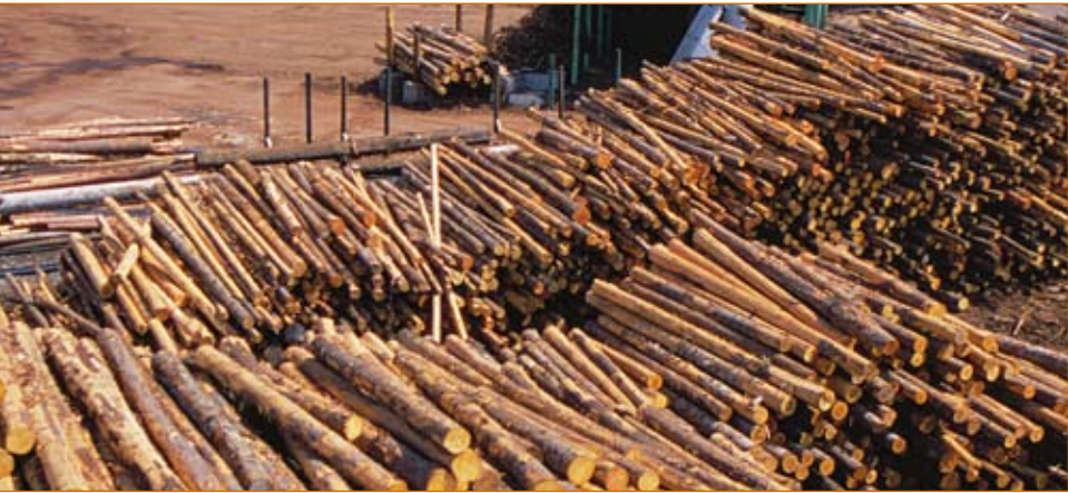
Vaagen Brothers mill.

“As much as we long for the good ol’ days, we must move forward for the health of our communities and forests—and that is what the Northeast Washington Forestry Coalition is doing.”