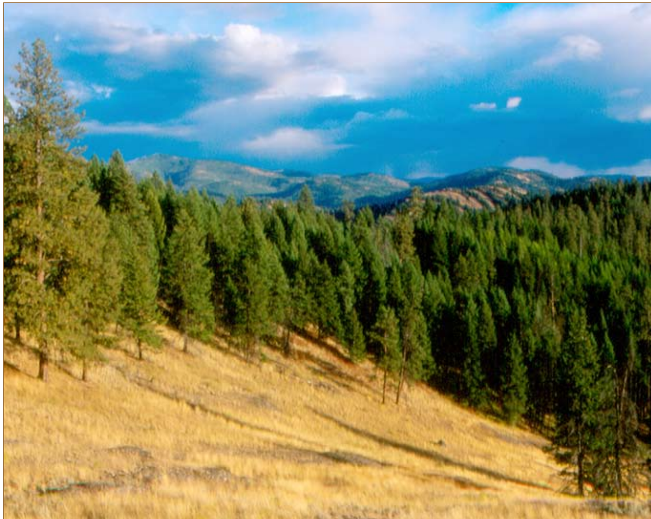
Thirteenmile Basin in the Kettle River Range.

In May 2002, after years of legal gridlock, timber industry and forest conservation leaders decided to stop fighting, start talking, and invite the public in to take part. The Northeast Washington Forestry Coalition is a collaborative forestry alliance that includes timber mill owners, conservationists, government