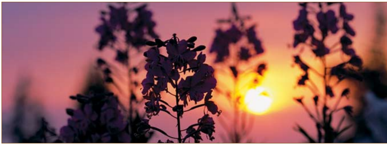
Fireweed on Abercrombie Mountain.