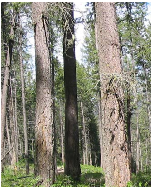
Large trees were retained through selective thinning at the Orient Stewardship Project site.

Burnt Valley , the first project completed with the Coalition's involvement, generated around 1.2 million board feet of timber while focusing on the area of greatest priority for the Forest Service and high priority in the Chewelah Wildfire Plan. Here, stewardship contracting authority was used to thin stands and create fuel breaks. Burnt Valley is currently being used as a model template for future wildfire reduction projects and as a banner example of the collaborative effort.