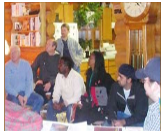
Community fire planning meeting with the Chewelah Fire District near Burnt Valley.